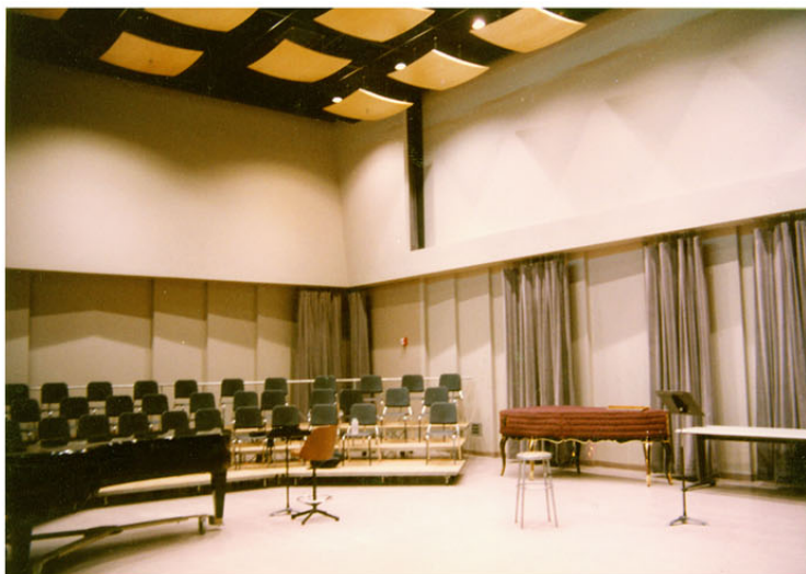
Variable Acoustics Ensemble Rehearsal combines with Choral Rehearsal