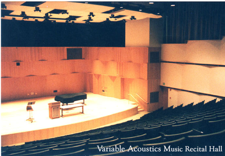
Variable Acoustics Music Recital Hall