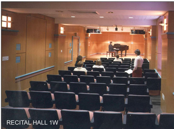
RECITAL HALL 1W