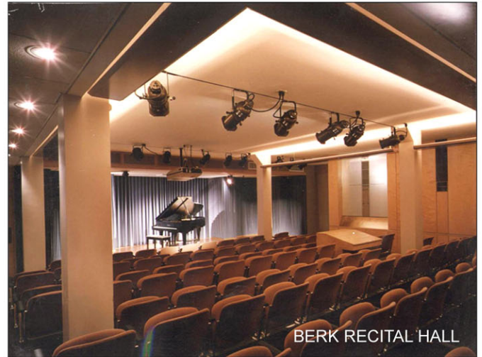
BERK RECITAL HALL