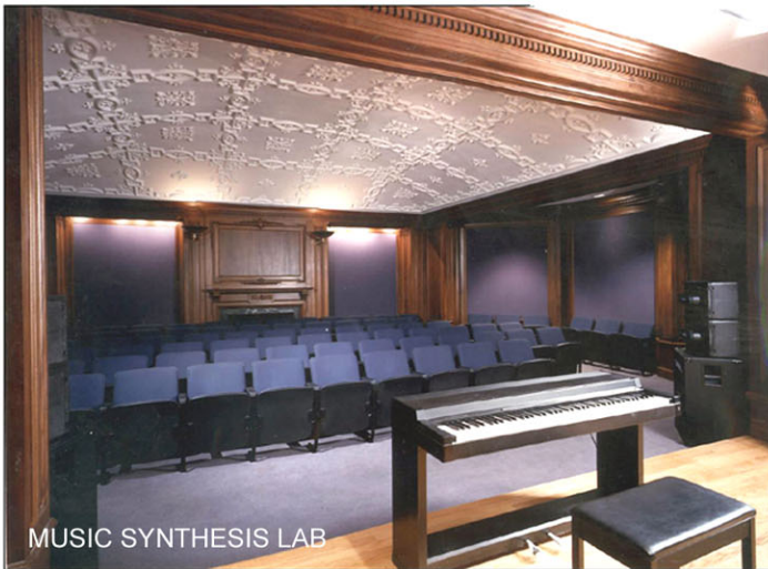
MUSIC SYNTHESIS LAB

MCKAY CONANT HOOVER INC Acoustics and Media Systems Consultants