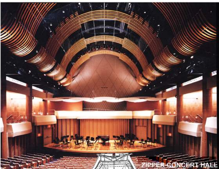
ZIPPER CONCERT HALL