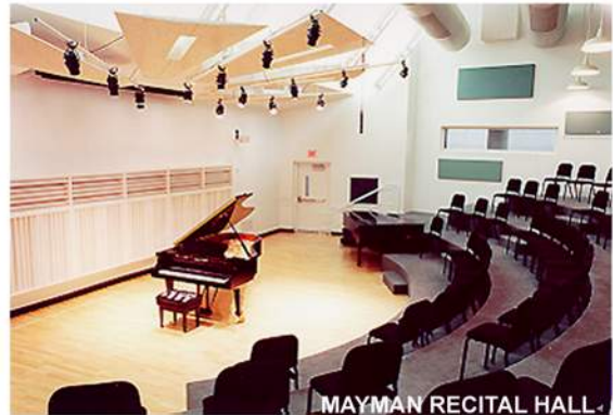
MAYMAN RECITAL HALL

MCKAY CONANT HOOVER INC Acoustics and Media Systems Consultants